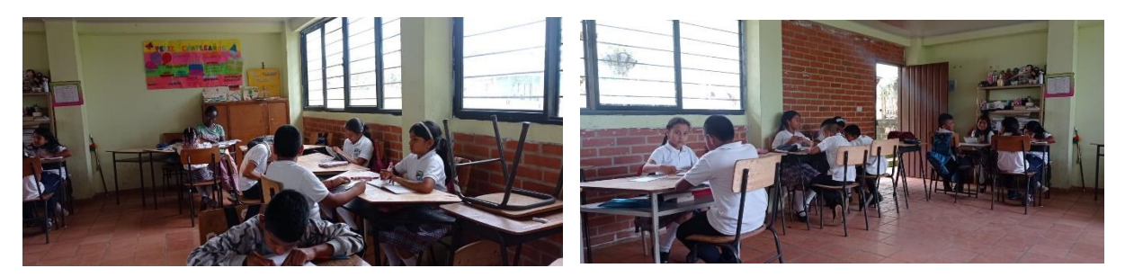
Figure 5. Knowing their differences.

Intercultural education takes us on the way to inclusion. This ensures that all children enjoy a pleasant educational experience and also learn from respect and their own differences. In Figure 5 it is seen that we tried to strengthen friendships, cultivate different attitudes of respect for their own culture or different cultures, and promote coexistence and fellowship no matter where they come from. We are convinced that if the practice of inclusion from intercultural perspectives is applied in daily practices from different subjects, inclusion and integration in society would be closer for our societies. As Cummins (1994) mentioned, the problem originates when integration does not occur, at which point social exclusion from the educational system appears and constitutes the first step in the process of marginalization, which leads to exclusion from the productive system and therefore exclusion from society itself. To avoid this escalated marginalization, it is necessary that schools and teachers work on inclusion from the early stages of life and from cross-curricular meaningful contents and strategies.