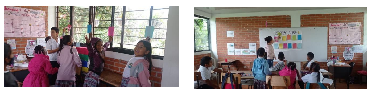
Figure 7. Playing and learning vocabulary

The strategy that emphasized culture the most was strategy 2, whose objective was to understand the language of the people around them, their community, and their celebrations. The intercultural objective was to establish an inclusive environment. The activities were carried out in parts, the first one was called "Linking colors with the correct name". The activity consisted of placing colored papers in their respective places. There were boxes with the names of the different colors, and they had to put papers of the correct colors in each one. This was an activity to break the ice and for them to enter the subject with more confidence. Before continuing, we decided to ask them if they knew the meaning of the colors in the indigenous culture. As some of them were unsure about the answer, we wanted to explain with the help of some classmates and guided by Memorias Nasa (2018). We recognized that each color has a special meaning in the Nasa culture: yellow symbolizes the sun, green represents the plants, red is the blood, blue is the sky, and white goes for purity. In addition, brown, black, and gray are said to be the colors of thought. The students wrote this information in their notebooks because it seemed very important to them since the Guardia