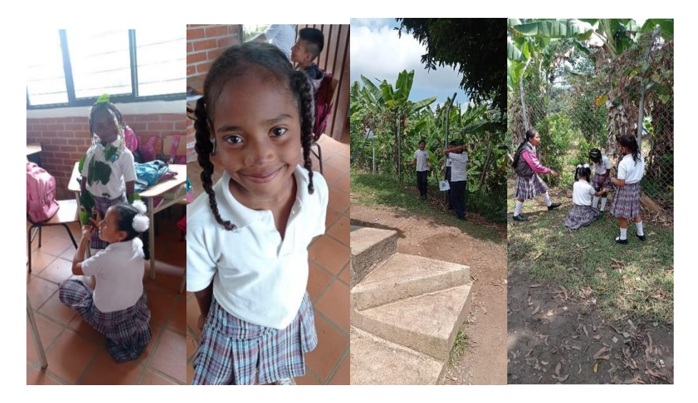
Figure 3. Becoming other characters.

These actions made us think that there was a better atmosphere in the class. It was time to present the plays to the class and we noticed that in one of the groups one of the girls did not want to take off her mask to perform, we insisted repeatedly but although she tried to speak loudly, the objective was not really achieved, we did not insist because we noticed that she was uncomfortable. After a few minutes we realized that the situation was not something normal for a girl of her age and we decided to approach her to talk about it, and in this context, we asked her why she refused to take off her mask, to which she answered that she did not do it because some of her male classmates said she was "ugly". When she told us this we passed the report to the homeroom teacher so that she would know the situation, later we decided to talk to the girl and highlight her characteristics, virtues, and qualities so that she would understand that none of these comments should affect her self-esteem since she was taking very seriously what they were saying to her, we emphasized that she was very beautiful girl and could not let herself be alluded to because of this. When we talked to her we realized that her classmates had asked her about the talk we had had with her, she decided to tell them how she felt, and immediately her mates started to say nice things to her and give her a lot of moral support. We did not expect these reactions, it took us by surprise and in the