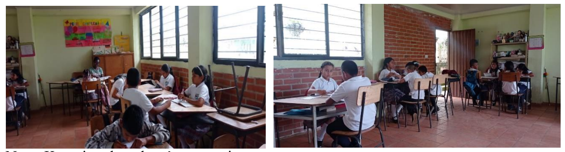
Note: Knowing the others' perspective

In the classroom, during all the sessions we found different situations that called our attention in a particular way since they were things that we did not expect, and apparently, the homeroom teacher did not expect either. There was a very particular session, to be exact strategy number 4, which consisted of forming groups of 5 people. First, each group was assigned a random image related to a story linked to the Nasa indigenous culture, it can be evidenced in Figure 2 . Clearly, the students did not know where these images came from so their task was to give a title and names to the characters or anything that was part of the same images, the main idea being that they would write their own story with those images. After 15 minutes we asked them to read their stories, each one of them was full of creativity and funny names, nonsense stories that they did not understand either but the idea was to exploit their creativity. After a good time of laughter and surprises we went on to read the real stories. Their reactions were surprising because they did not expect any of this and even less something related to their culture.